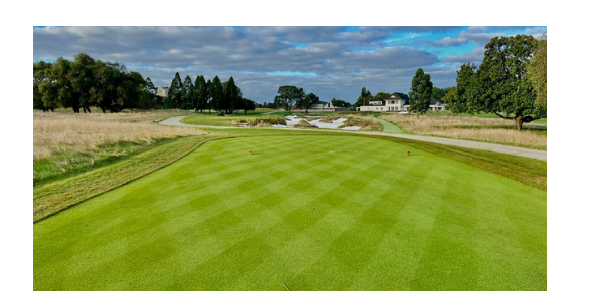
Royal Auckland and Grange