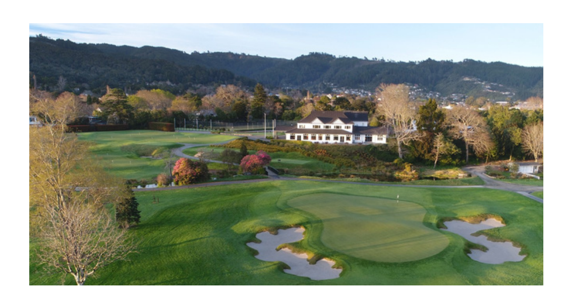
Royal Wellington Golf Club