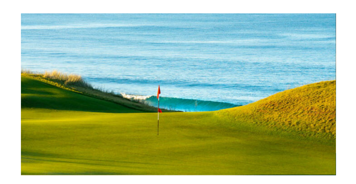
Te Aria South Course