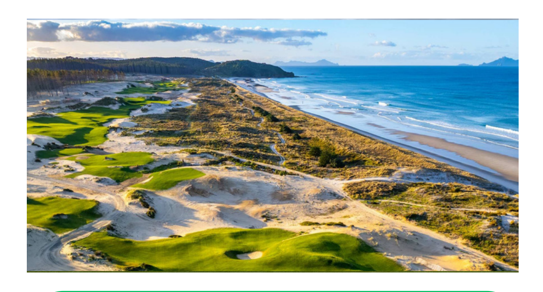
Te Aria North Course