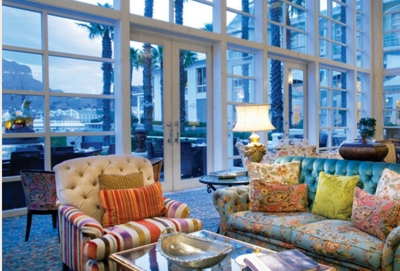
Table Bay Hotel

Inspired by the boundless creative energy of the city that it calls home, The Table Bay offers unrivalled Victoria and Alfred Waterfront accommodation which celebrates Cape Town's colourful cultural heritage, evocative romance and irresistible spirit of adventure. Straddling the working V&A harbour and vibrant city bowl beneath the majestic zenith of Table Mountain, The Table Bay enjoys the best address in Cape Town, and invites you to discover an authentic South African 5-star experience in the Mother City.